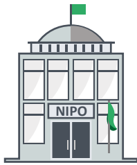
National IP Office

Before filing an international application, the applicant needs to have an existing national trade mark (or trade mark application) in the IP office of one of the territories of the Madrid System (the basic mark).